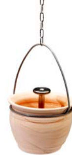
Fragrance diffuser (Art. 9002 9046)

A collection of five specially selected 100% essential oils in a gift package.