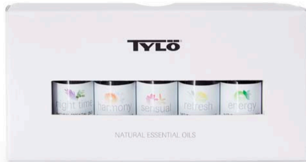
Collection of essential oils (Art. 9002 3024)

A collection of five specially selected 100% essential oils in a gift package.