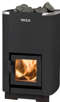
Tylö sauna stove TL-20 (Art. 6405 4130)