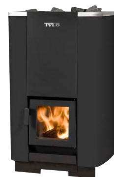
Tylö sauna stove TL-37 (Art. 6405 4150)