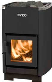
Tylö sauna stove TL-12 (Art. 6405 4110)