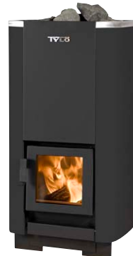
Tylö sauna stove TL-27 (Art. 6405 4140)