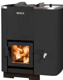
Tylö sauna stove TL-20V (Art. 6405 4131)