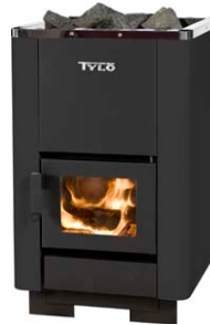
Tylö sauna stove TL-16 (Art. 6405 4120)