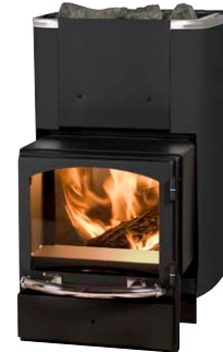
Tylö sauna stove TSIS-20 (Art. 6405 4160)