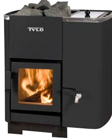
Tylö sauna stove TL-12V (Art. 6405 4111)